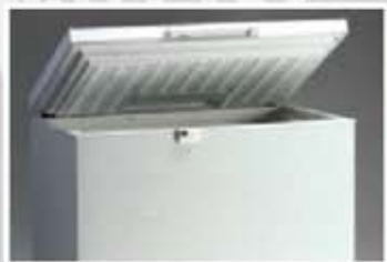
DC Fridge/Freezer 12V/24DC