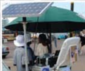
Solar Photo Shop